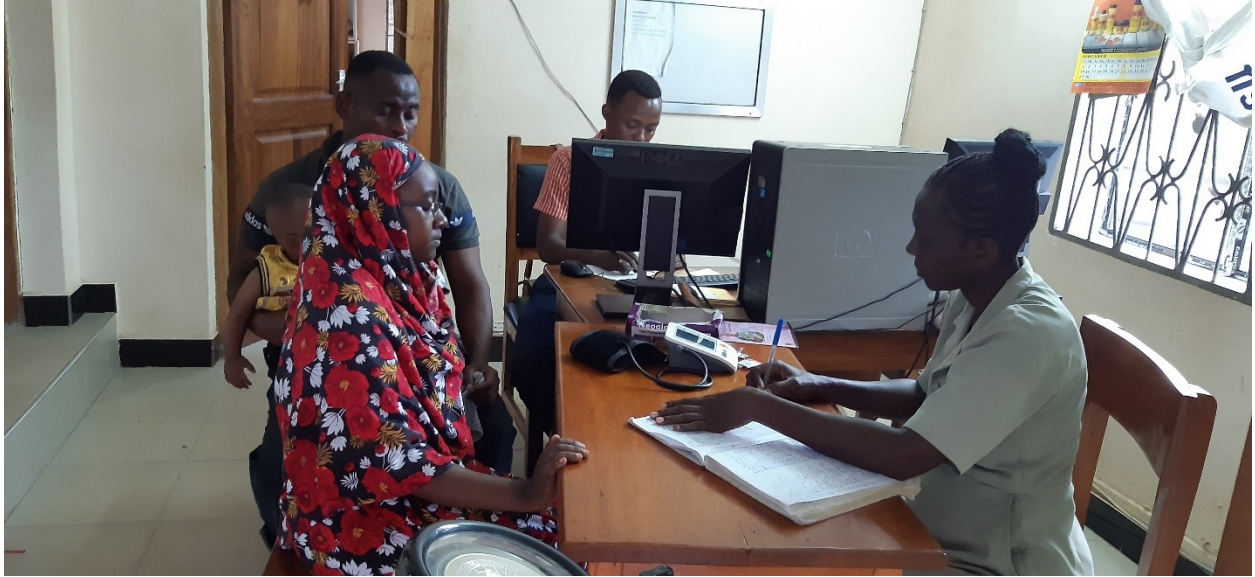
Figure 2. PATIENTS ARE REGISTERED.