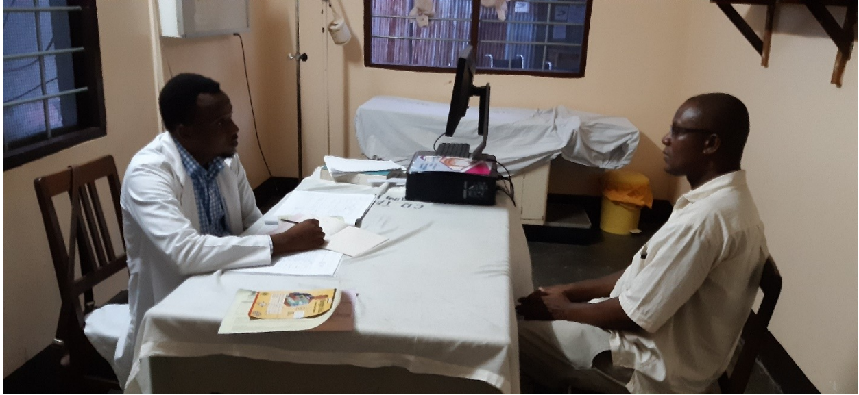
Figure 3. DOCTOR ATTENDING PATIENT