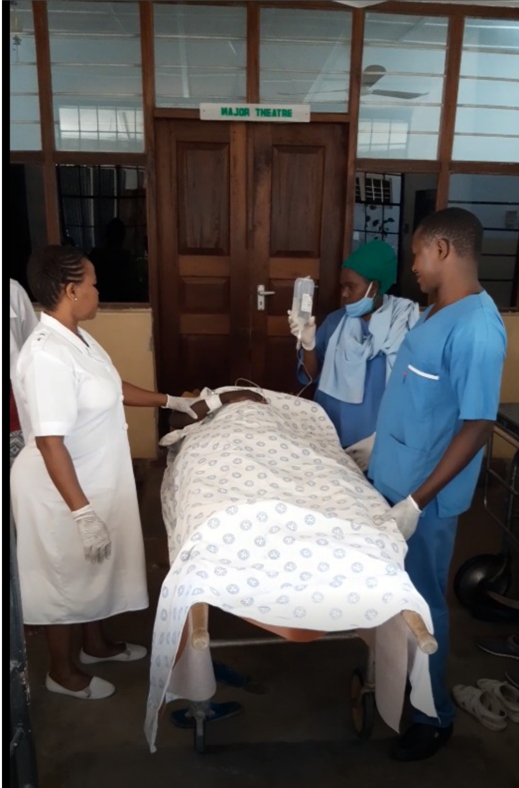
Figure 8. PATIENT TAKEN FROM MAJOR THEATER AFTER OPERATION