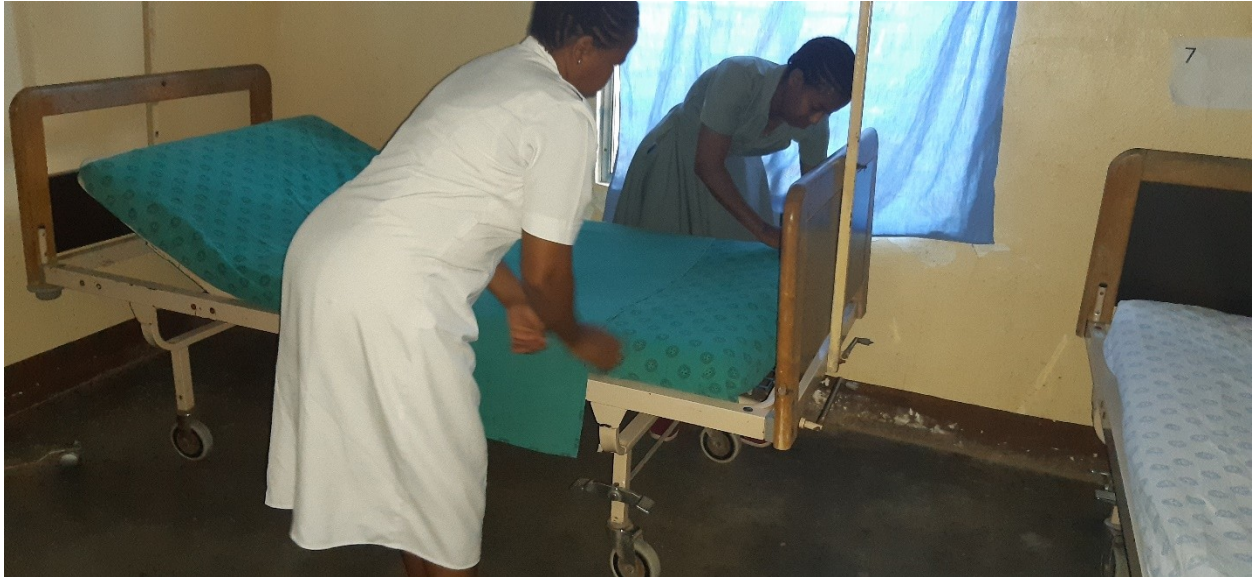
Figure 10. NURSES ARE BED MAKING FOR A PATIENT