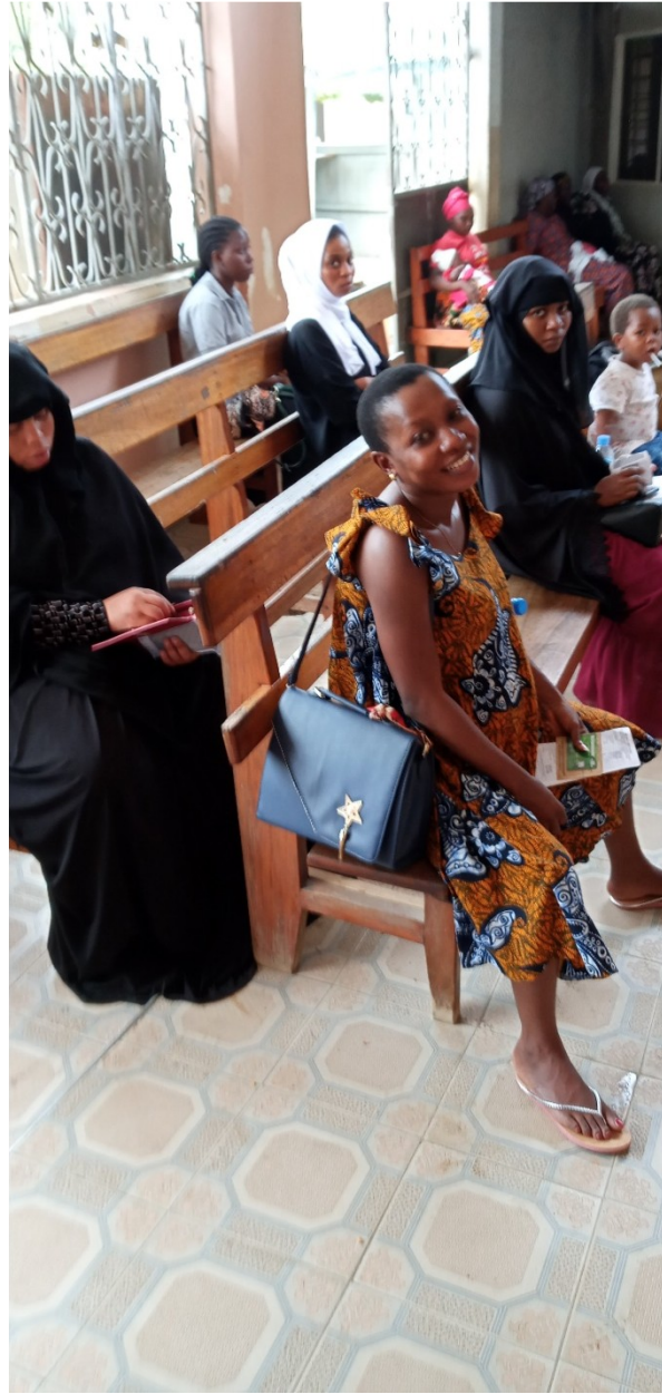
Figure 1. PATIENTS WAITING FOR REGISTRATION