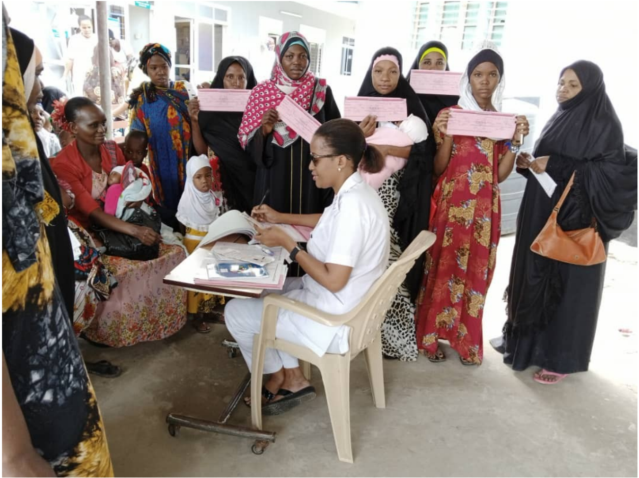
Figure 6. MOTHERS TAKING BIRTH CERTIFICATES FOR THEIR NEW BORN BABIES.