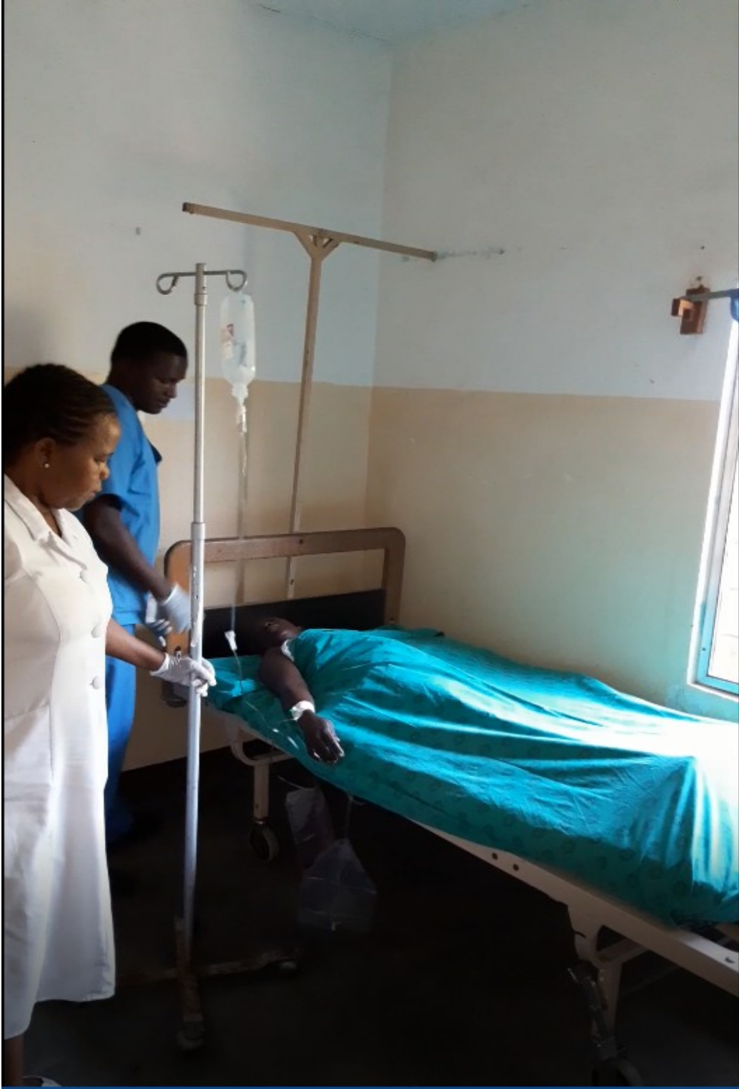
Figure 9. PATIENT IN THE WARD AFTER OPERATION