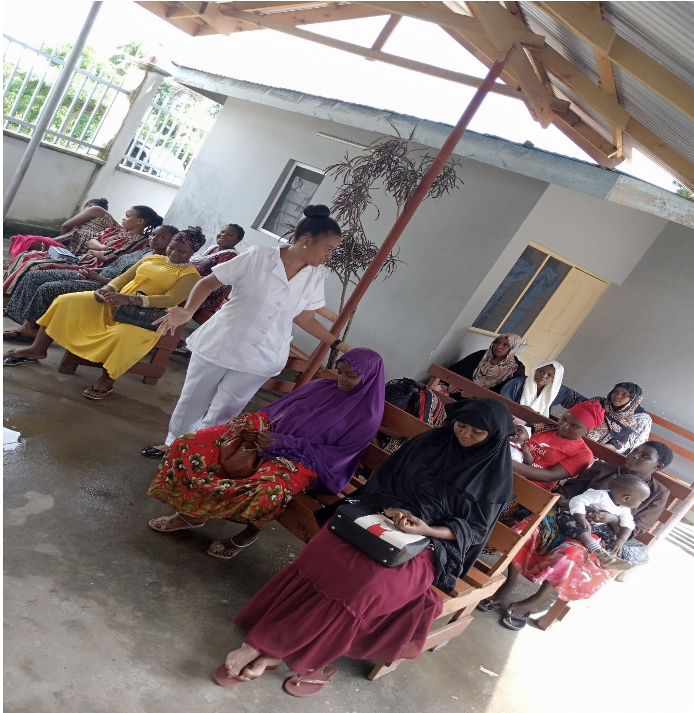
Figure 5. HEALTH EDUCATION AT ANT-NATAL CLINIC