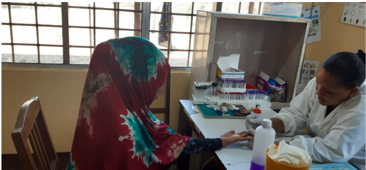
Figure 4 LABORATORY TECHNICIAN TAKING BLOOD FOR TESTING MALARIA